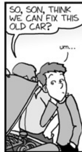
PHD IN MECHANICAL ENGINEERING