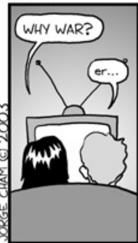
PHD IN POLITICAL SCIENCE