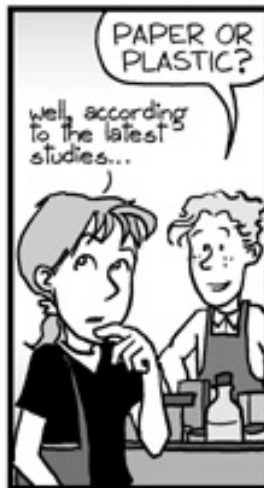
PHD IN ENVIRONMENTAL ENGINEERING