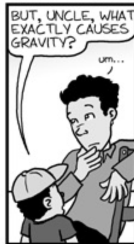
PHD IN PHYSICS