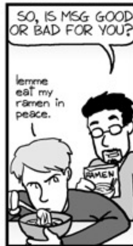
PHD IN BIOLOGY